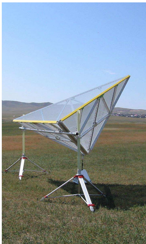
Trihedral Corner Reflector (Portable Type)

The trihedral corner reflector provides the specified radar cross section (RCS) for the Synthetic Aperture Radar (SAR) of ALOS-2 to maintain the precise land coverage observation. It was used by JAXA for ALOS-2 calibration.